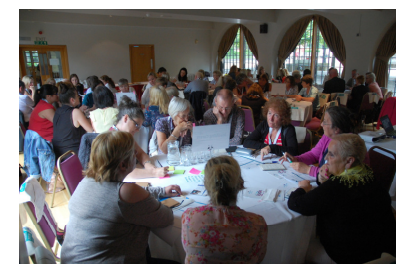
World Café discussions – what is harm?